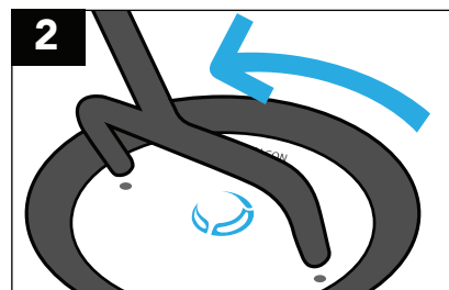
2 Turn key to left to unlock.