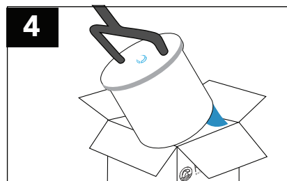
4 Place cartridge into bag, tie bag to seal and dispose.